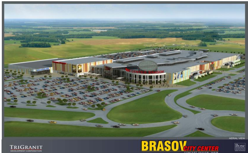
Polus Center model

All associated tasks in the following four areas of action were handled: