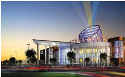
Polus Center entrance

The Polus Center will offer its visitors a new shopping experience and a variety of restaurants, as well as numerous leisure activities, in a safe and modern environment.