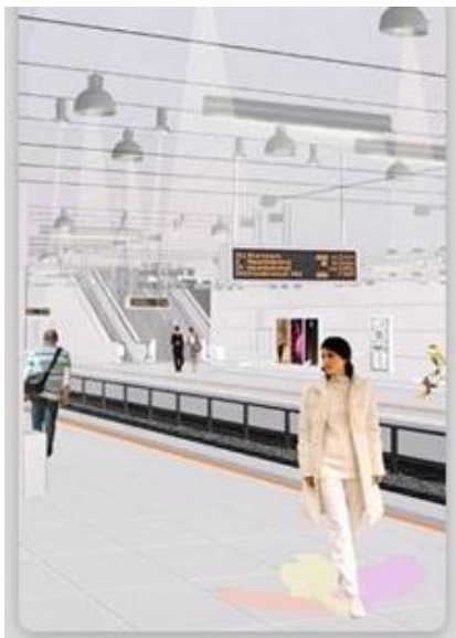
Planned underground station

The Karlsruhe combined solution consists of two projects, which are separate but inseparable: these are the 3.4 km rail tunnel with 7 stations and a new, 1.6 km long tram route including 3 stops above this tunnel. The rail tunnel, which will be partly driven by underground means and partly constructed by shield tunneling, will create a rail-free pedestrian zone of a length of 1.0 km.